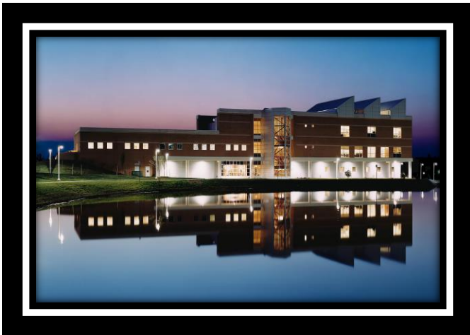
Northern Virginia Community College – Loudoun Campus

Located in the Loudoun County Public Schools district which is known as one of the top public schools district in the nation this beautiful townhome is inside the Belmont Station Elementary School, Trailside Middle School and Stone Bridge high school district. Loudoun county public schools is the fastest growing school division in Virginia and one of the fastest growing public school districts in the United States. According to the Washington Post's Challenge index Loudoun's public high schools ranked in the top 6 percent nationally. This is a lovely top level two floor townhouse/condo with a 1 car garage. You will absolutely love this house filled with plenty of storage, driveway, deck, Loft/Study area on upper floor with a spacious-large master suite. Relax in your master suite and enjoy your 2 additional bedrooms. There is a 1/2 bath and breakfast nook on the main level. Main level also has a impressive gourmet kitchen w/granite, upgrades & a beautiful open format.