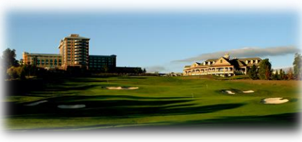
The Golf club at Lansdowne