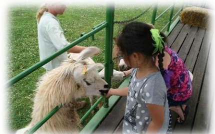
Leesburg Animal Park