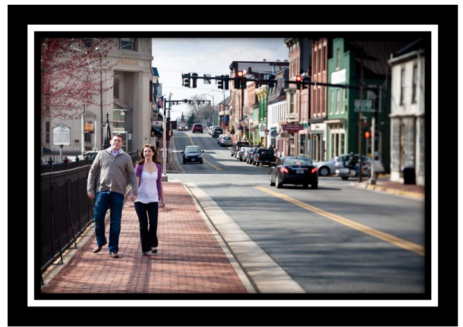
Downtown Historic Leesburg