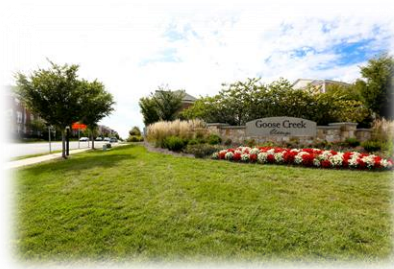
Goose Creek Village