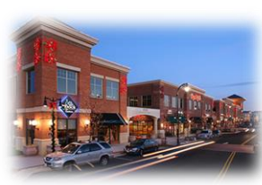
Lansdowne town center