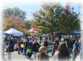
Fall yearly festival