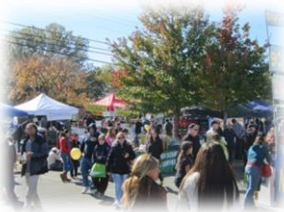
Fall yearly festival