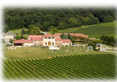
Loudoun is known for Wineries