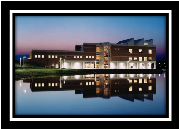
Northern Virginia Community College – Loudoun Campus

Located in the Loudoun County Public Schools district which is known as one of the top public schools district in the nation this beautiful Condo/townhome is inside the Rosa Lee Carter Elementary School, Stone Hill Middle School and Rock Ridge High school district. Loudoun county public schools is the fastest growing school division in Virginia and one of the fastest growing public school districts in the United States. According to the Washington Post's Challenge index Loudoun's public high schools ranked in the top 6 percent nationally. This is a lovely top level two floor townhouse/condo with a 1 car garage. You will absolutely love this house filled with plenty of storage, driveway, deck, open floor plan and a spacious-large master suite. Relax in your master suite & enjoy your 2 additional bedrooms.