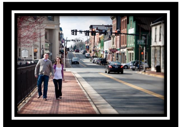
Downtown Historic Leesburg