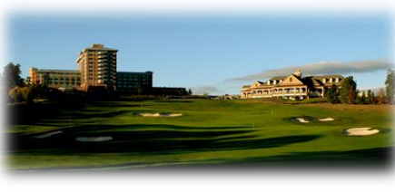
The Golf club at Lansdowne