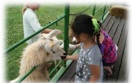
Leesburg Animal Park