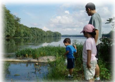
Elizabeth Mills Riverfront Park