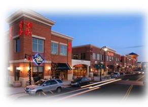
Lansdowne town center