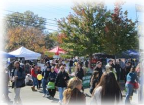
Fall yearly festival