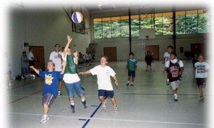
Springfield community center