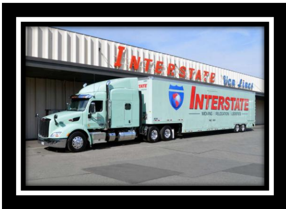
Headquarters of Interstate Van Lines

Country living in Springfield! Magnificent home & property in a quiet, safe, cul-de-sac. Brick front with hardwood flooring all threw the main floor with carpet in the basement and upstairs bedrooms. Wet bar and den in basement with second living room and dining room. 2 car garage, hot tub with gazebo, deck, security system and amazing wooded lot! HUGE YARD with no neighbors behind you! Minutes from the metro, shopping and park! This one shines! Seller wants offers - hurry this will not last