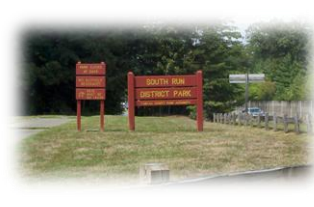
Multiple parks & recreation