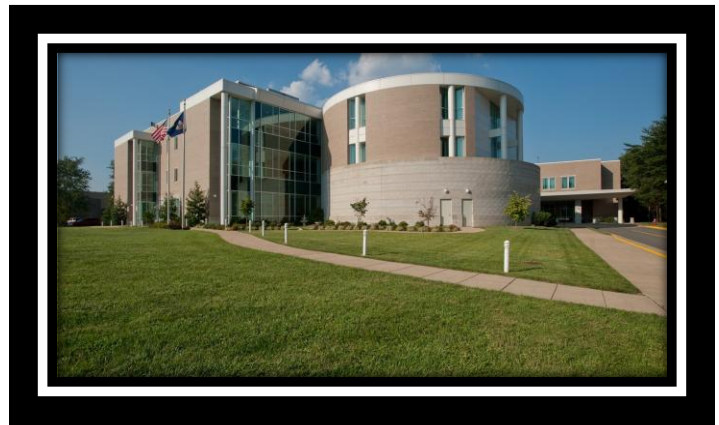
Northern Virginia Community College - Medical Education Campus