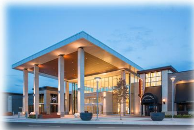
Tons of shopping and restaurants