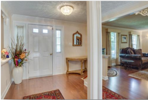
Hardwood flooring on the main floor