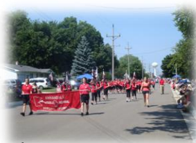
4 th of July yearly parade