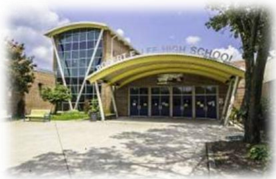
Lee High School