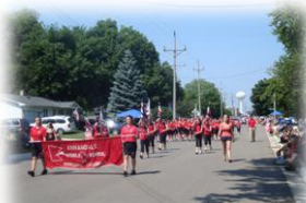
4 th of July yearly parade