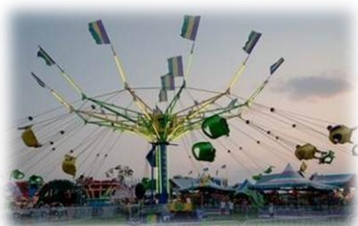
Yearly Fairfax Fair