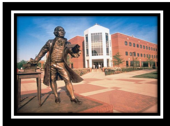
George Mason University