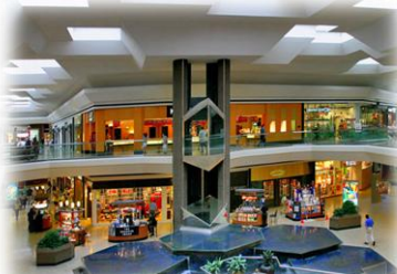
Tons of shopping and restaurants