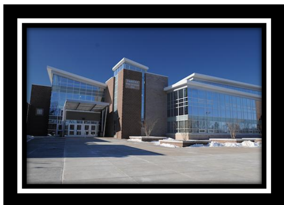
Fairfax High School

Stop and look no more! Gorgeous Upper level condo in PERFECT condition with A Private GARAGE parking and Driveway. Gourmet Kitchen features SS appliances & granite, ceramic floors. Large living room with GAS fireplace, great dining area with convenient granite built in desk space. Large master bedroom with luxury bath. Large second bedroom with walkin closet. Close to I66, FFX Prkwy, Shopping & Wegmans!