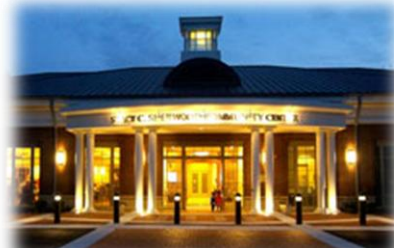
Fairfax community center