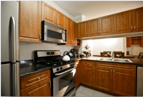
Large Open Kitchen