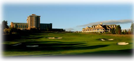
The Golf club at Lansdowne