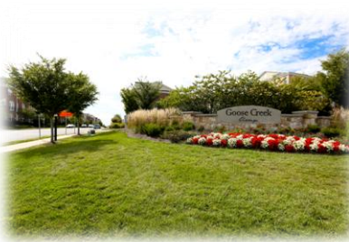
Goose Creek Village