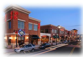
Lansdowne town center