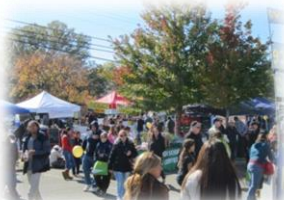
Fall yearly festival