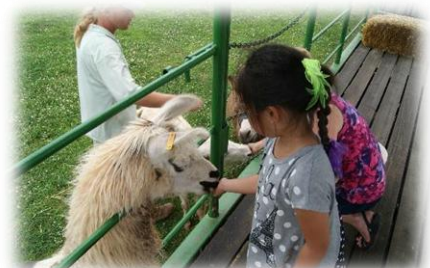
Leesburg Animal Park