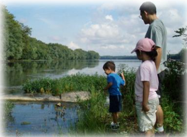
Elizabeth Mills Riverfront Park