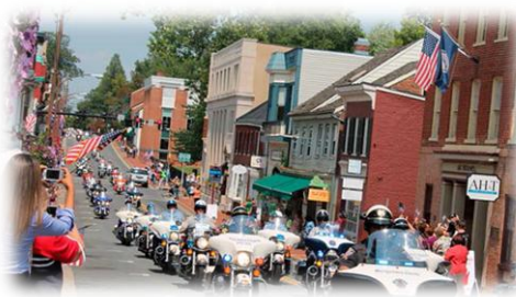
Leesburg yearly parade