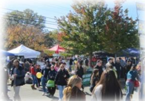
Fall yearly festival