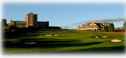
The Golf club at Lansdowne