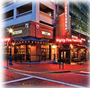
Over 30 Restaurants & Eateries