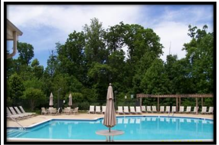
Large outdoor swimming pool