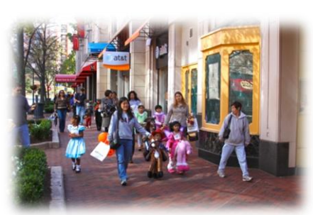
Over 100 stores to choose from