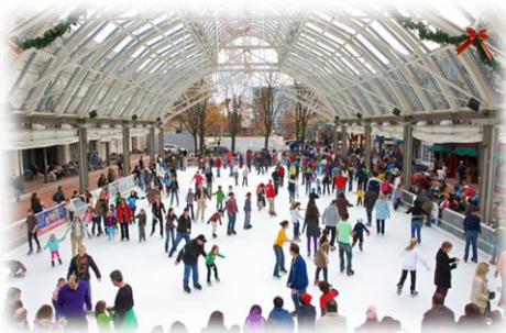
Outdoor Ice Skating in Reston Town Center