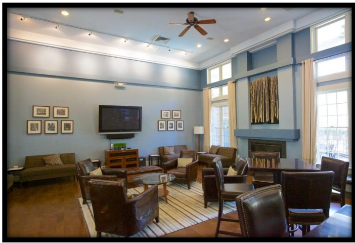
Renovated Club House featuring pool, gym, party room & more