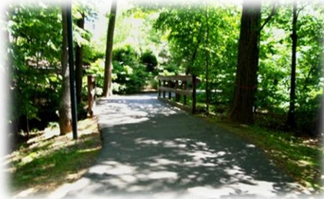
Trails leading to WO&D and Town Center