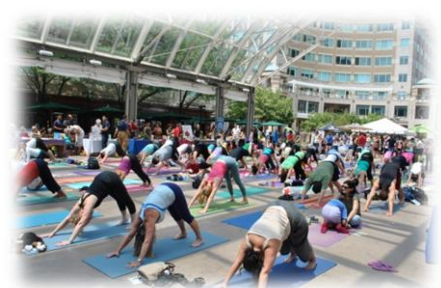
Yoga Classes in Reston Town center