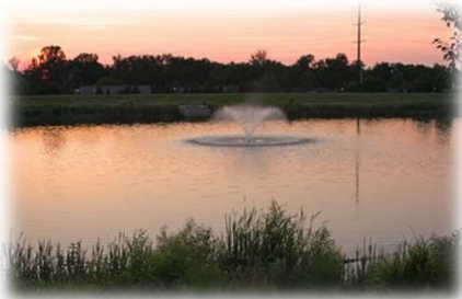
West Market 5 Acre Pond